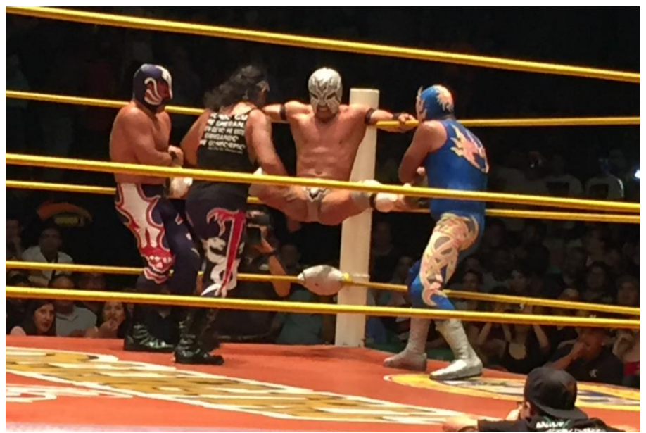
Lucha Libre, Mexican wrestling, the subject of one student documentary, and a fun night out for 2017 field school crew.

school experience, including the video documentaries themselves, and links to additional articles, photos and information. To date more than 120 Mount Royal and TEC students have come together and completed 27 documentary projects. Working in mixed teams of Mexican and Canadian students, documentary crews have examined such issues as LGBTQ rights in Catholic Mexico, the punk music scene in Guadalajara, and graffiti as an art form in the Mexican muralist tradition. Other documentaries have explored cultural themes such as