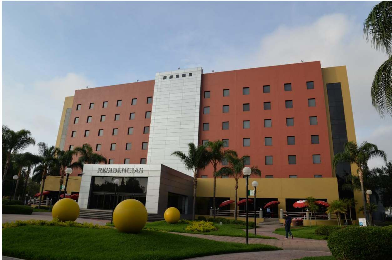
Student residence at TEC Guadalajara, where MRU students stay during the field school.

The Guadalajara campus of TEC de Monterrey is located in the municipality of Zapopan about a 30-minute drive to Guadalajara's central plazas. The campus is largely open to the elements and contains gardens, recreation facilities and Wi-Fi-equipped patios. MRU students will live among the palm trees and lush greenery in modern dorms on campus. The entire campus is inside a secure, well-monitored perimeter.