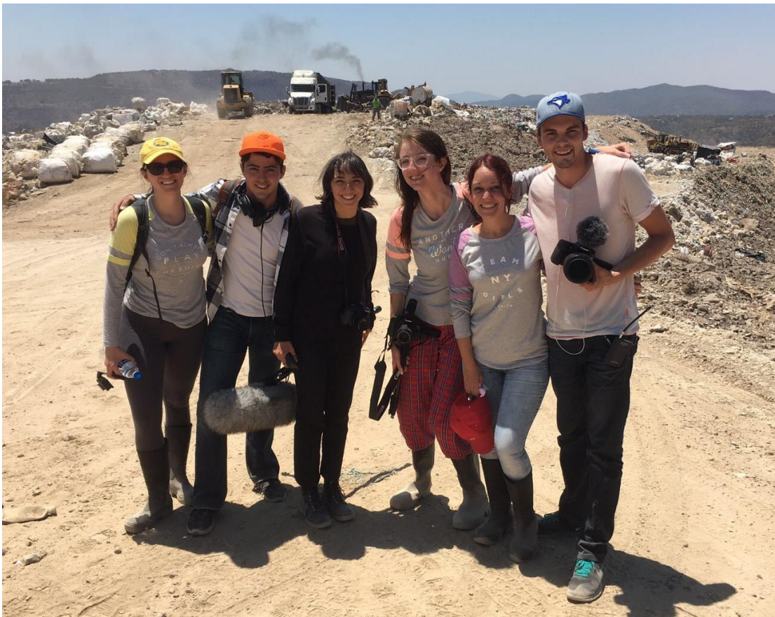
MRU and TEC students working on their documentary film, Pepinadores – Trash Collectors, June, 2017

Study Abroad in Mexico – June 1 – July 5, 2019