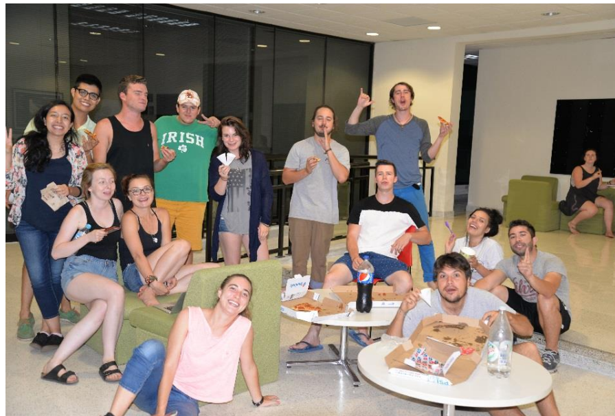
MRU and Tec students enjoying late night editing... and pizza!

Students will be responsible for booking air transit from Calgary to Guadalajara. Students arrive in Guadalajara on Saturday June 1, 2019, and should consult with their professor on their planned return date before booking a flight.