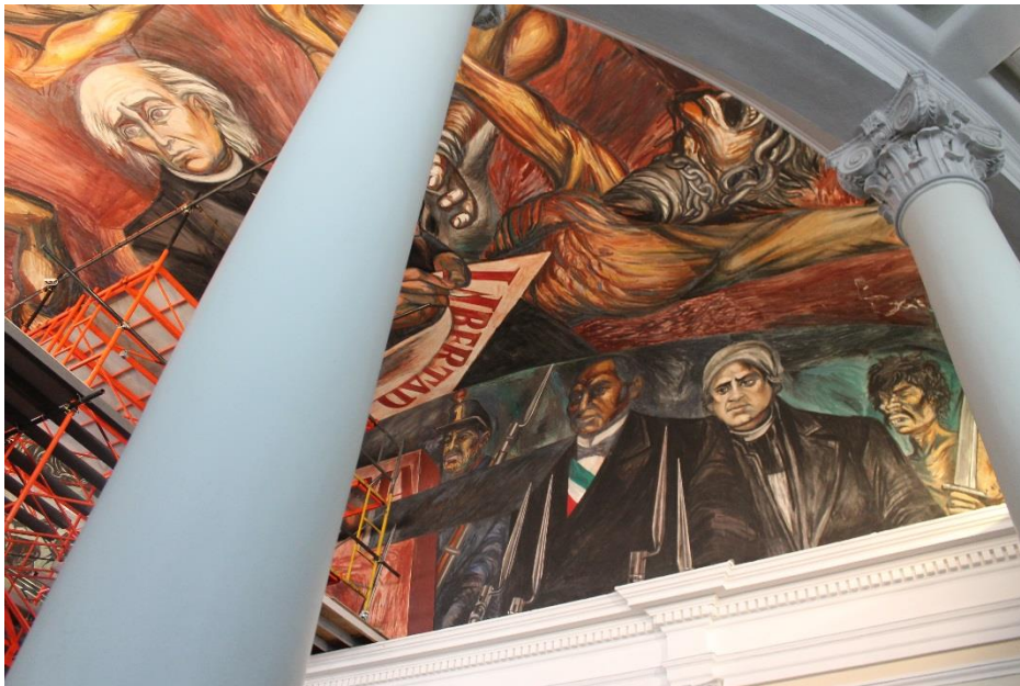
Incredible muralist art of Jose Orozco in Guadalajara's municipal buildings.

This TEC course transfers to MRU as LAST 2202 (Intro to Mexican and Latin American Cultures) and will satisfy a general education tier 3 cluster 2 or elective requirement. International students attending TEC de Monterrey's summer school in Guadalajara are introduced to the rich tapestry of Mexican culture, and the fascinating political history of one of Canada's most important trading partners. Beginning with the arrival of the Spanish in the 1500s, students will consider key aspects of the colonization of what is now Mexico, and then focus on Mexico's fight for independence, the revolution of 1917 and Mexico's political life today.