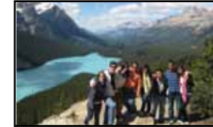
Escape to the Rocky Mountains