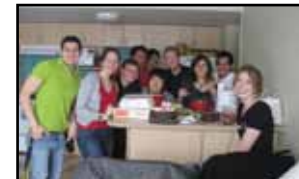
Meet friends and roommates