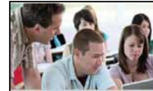
Free access to our computer labs

"The quality of English education really helped me improve my English language skills. In addition, I had the chance to meet new people from different cultures"