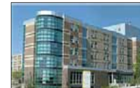
Live at Mount Royal Residences

You can stay in the Mount Royal Residence only steps away from classes. Each fully-furnished unit has four private single bedrooms, two bathrooms, a shared living room with a television, and a kitchen with basic equipment. The Residence provides a weekly change of bedding and towels plus some basic cleaning services as well as coin-operated laundry facilities and games rooms.