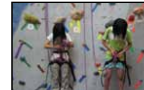
Get active: access to recreation centre for a small fee ($40 Cdn)