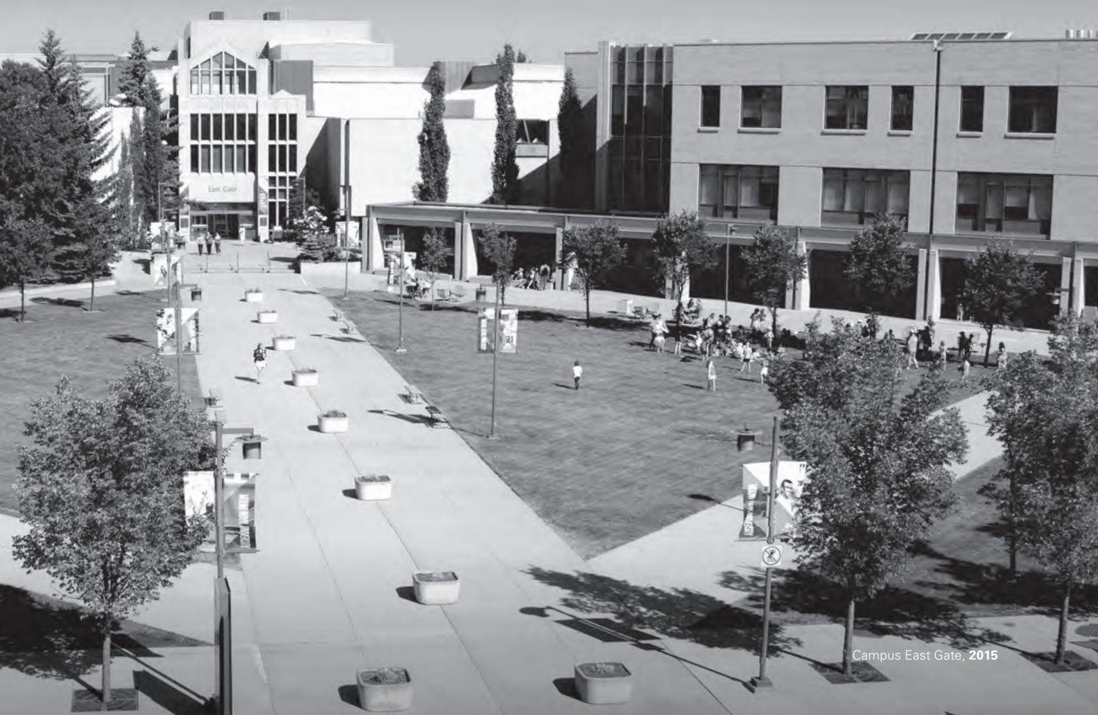
Campus East Gate, 2015

initiated bachelor's degrees in arts — criminal justice, business administration, communication and science