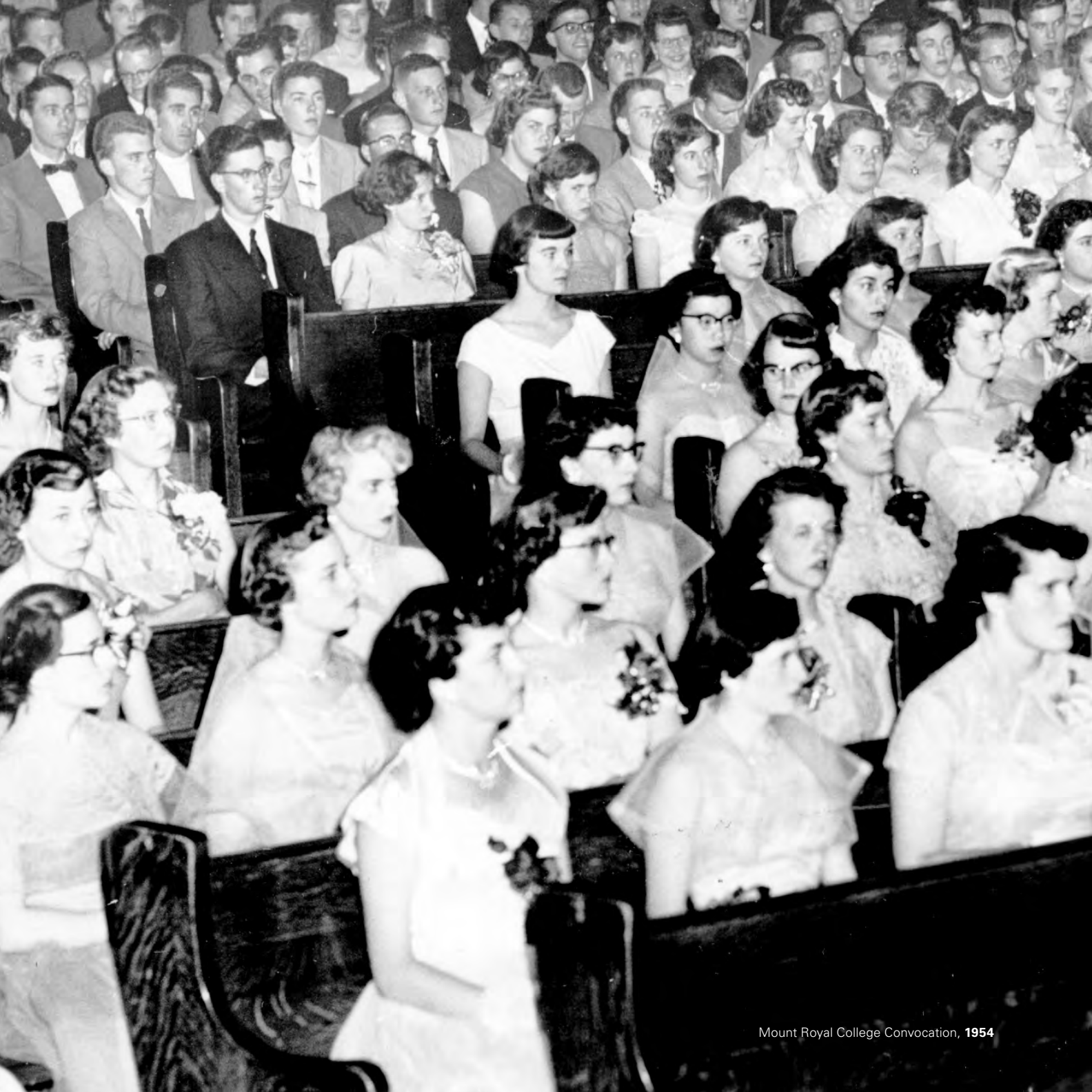
Mount Royal College Convocation, 1954