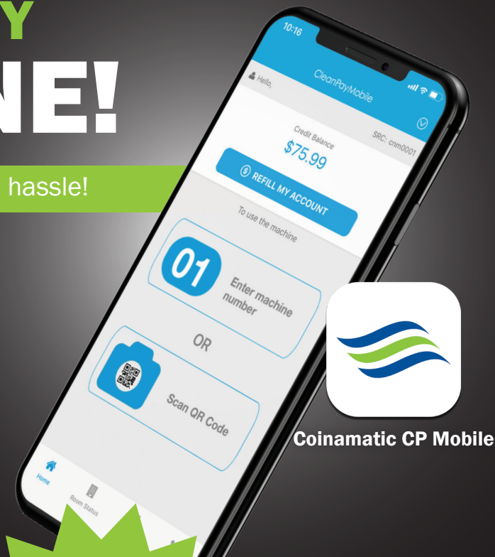
Coinamatic CP Mobile

Download the app AND add funds TO RECEIVE A FREE WASH AND DRY!