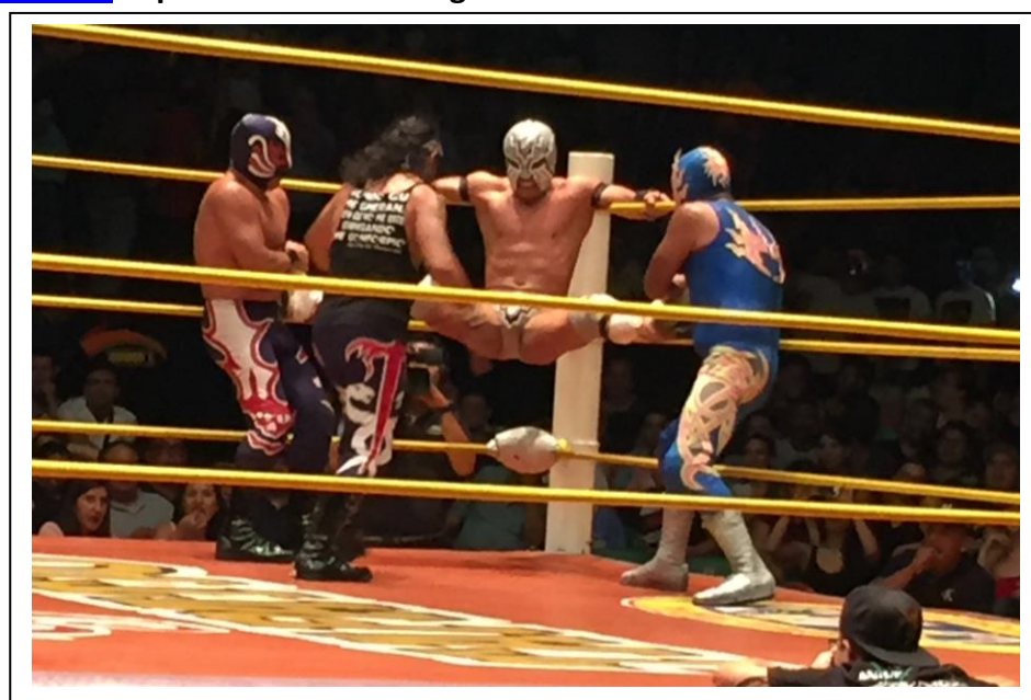
Lucha Libre, Mexican wrestling, the subject of one student documentary, and a fun night out for 2017 field school crew.

school experience, including the video documentaries themselves, and links to additional articles, photos and information. To date more than 120 Mount Royal and TEC students have come together and completed 27 documentary projects. Working in mixed teams of Canadian Mexican and students, documentary crews have examined such issues as LGTBQ rights in Catholic Mexico, the punk music scene in Guadalajara, and graffiti as an art form in the Mexican muralist tradition. Other documentaries have explored cultural themes such as