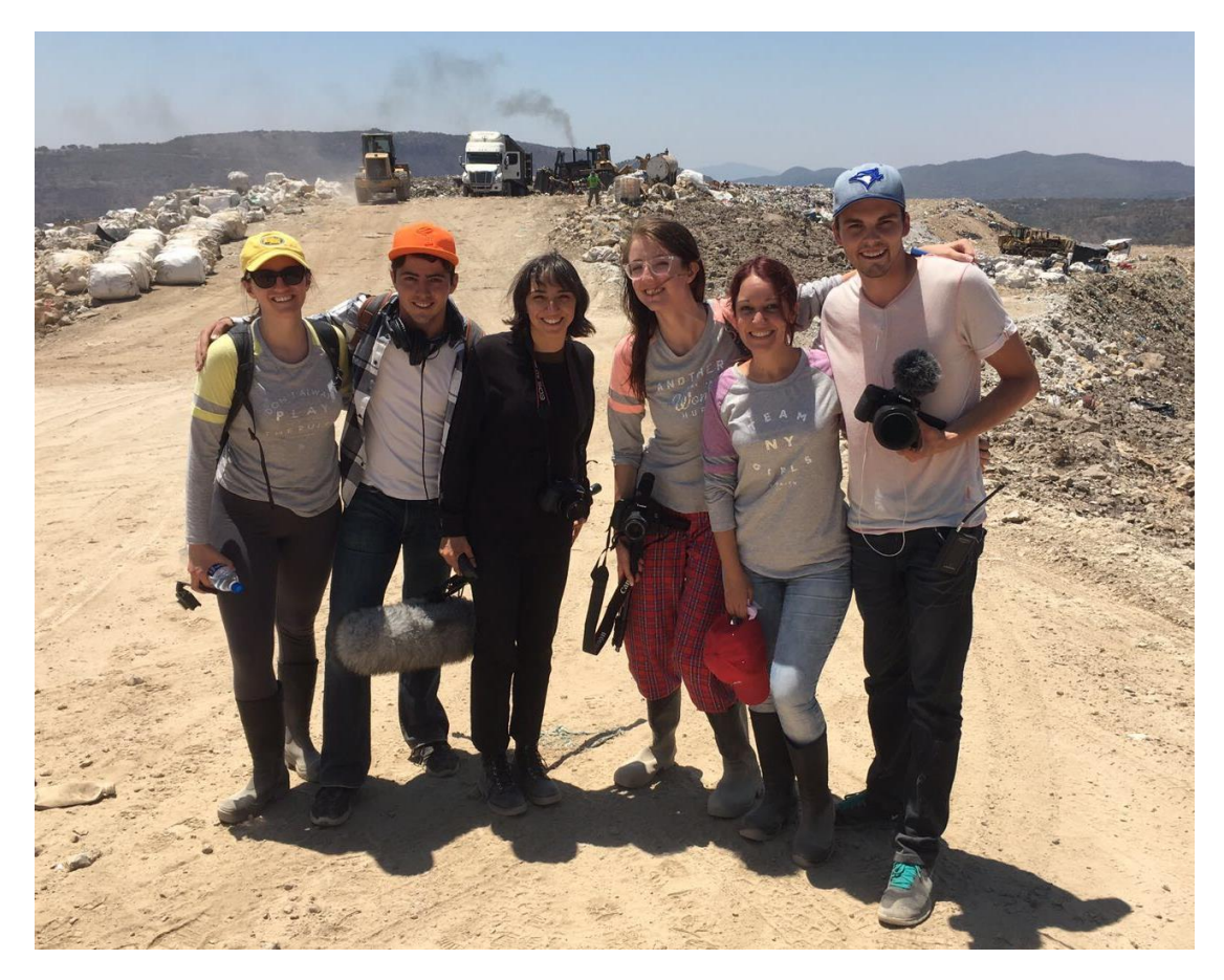
MRU and TEC students working on their documentary film, Pepinadores - Trash Collectors, June, 2017

MOUNT ROYAL – TEC de MONTERREY Study Abroad in Mexico – June 1 – July 5, 2019