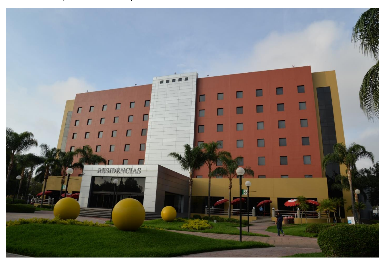
Student residence at TEC Guadalajara, where MRU students stay during the field school.

The Guadalajara campus of TEC de Monterrey is located in the municipality of Zapopan about a 30-minute drive to Guadalajara's central plazas. The campus is largely open to the elements and contains gardens, recreation facilities and Wi-Fi-equipped patios. MRU students will live among the palm trees and lush greenery in modern dorms on campus. The entire campus is inside a secure, well-monitored perimeter.