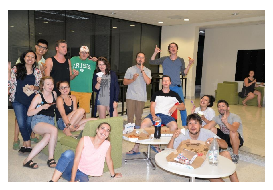
MRU and Tec students enjoying late night editing... and pizza!

Students will be responsible for booking air transit from Calgary to Guadalajara. Students arrive in Guadalajara on Saturday June 1, 2019, and should consult with their professor on their planned return date before booking a flight.