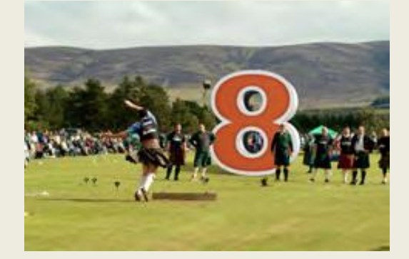
Community capacity and empowerment – targeting the places most in need