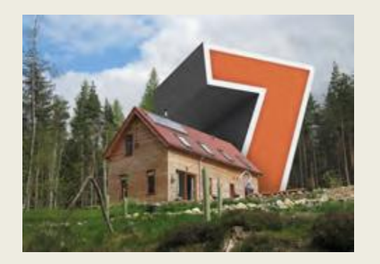
Housing – meeting housing needs