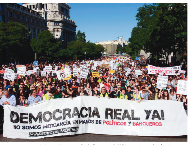
Anti-austerity protest, Spain

The 2015/16 global economic outlook, though still sluggish, is somewhat stronger than it was for 2014, thanks mainly to a recovery in the US.1 Seattle (airplanes), and Silicon Valley and NYC (high tech / information) are especially strong nodes of growth. The global recovery has proved to be a long, tough climb back: Three years ago, the International Monetary Fund (IMF) projected that the world economy would be back on track by 2015, growing at 4.8 percent.<sup>2</sup> Previous modestly bullish 2015 forecasts have been revised across the globe. The U.S. has met the IMF's (albeit diminished) expectations, but the so-called BRIC nations—Brazil, Russia, India, and China—as well as parts of the Middle East, Europe, and Japan - have all floundered. The Chinese economy is stalled, experiencing its slowest growth since 2009. Even Germany's massive trade surplus is expected to shrink in 2015, challenged further by the fall of scandal-plagued Volkswagon AG and the unprecedented wave of refugees that Germany has welcomed. As such, the IMF's 2015 global growth forecast has been adjusted to 3.2 percent, though for the time being is pegged higher for 2016.3